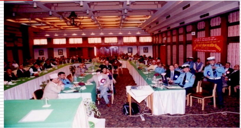
JICA Ex. participants exchanging the knowledge acquired in Japan with JAAN members, Govt. people and community from hotel rooms to villages (farmer's field)