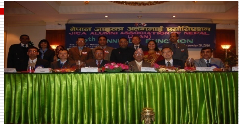
JAAN Executive Committee & Members with the then Mr. Madhav Kumar Nepal, HE Ambassador of Japan to Nepal & JICA CR in a Annual Function Program