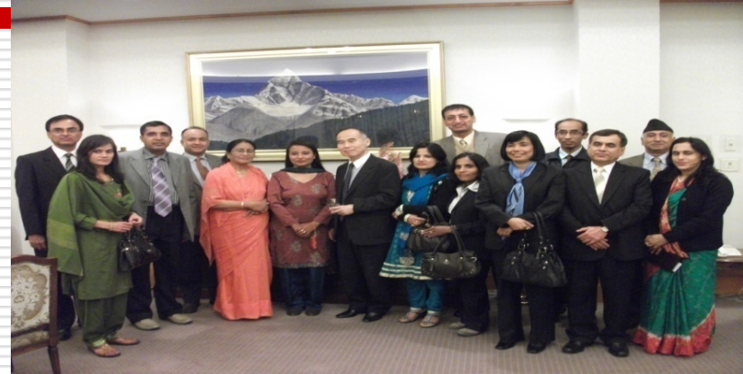
HE Ambassador of Japan to Nepal organize meetings with JAAN Members time to time