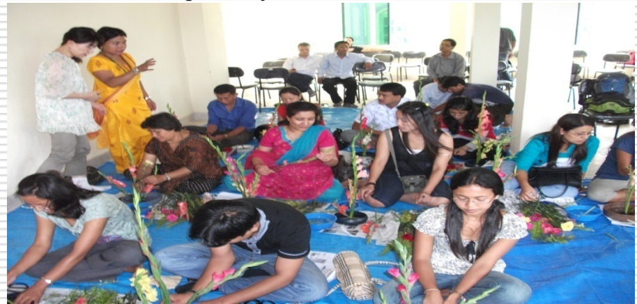
Ikebana program in JAAN CDC